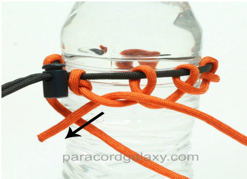
Continue the same process of bringing the end down through the first loop and over the other end of the cord.

World's Largest Selection Of USA made 550 Paracord In 1,000 + Colors and Patterns