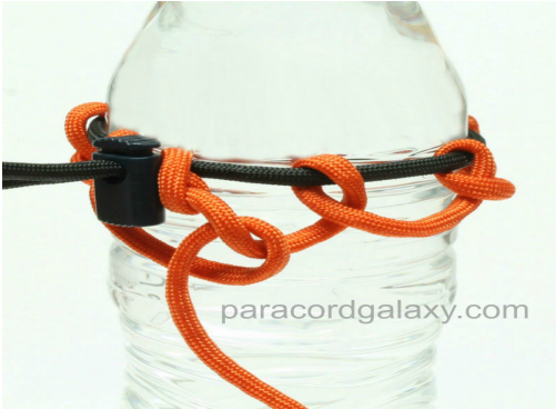
Pull tight and continue until you reach the desired height